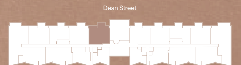
Dean Street Bergen Street