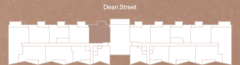
Dean Street Bergen Street