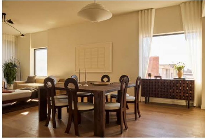
Flooded with natural light, the space highlights the dark walnut table, sculptural seating, and linen pendant light, in dialogue with the handcrafted carpentry and furnishings by Olive Atelier. Jonathon Hokklo

The apartment is in constant dialogue with the outdoors: a large terrace with an outdoor kitchen and barbecue opens onto the living room, while the private rooftop features a heated plunge pool and dining area. "The goal was to conceive the outdoor spaces as a natural extension of the interior, establishing a direct dialogue between the two worlds to achieve a seamless fusion."