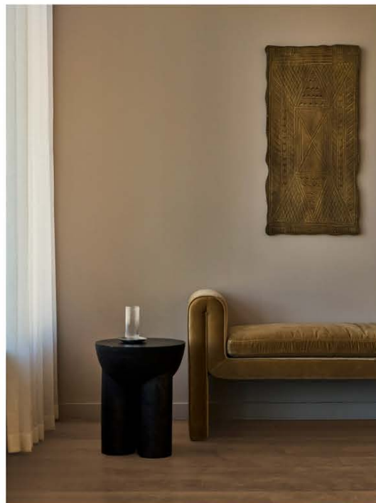
In the bedroom, a camel velvet bench creates an intimate and relaxing refuge. Jonathon Hokklo

In every space, light is a key design consideration. "Our multidisciplinary practice integrates design at every scale, including lighting," observes Mahoney. "In this penthouse in Bergen, the custom-designed entryway sconce doesn't just illuminate the space; it helps define its identity and sets the tone from the moment you arrive."