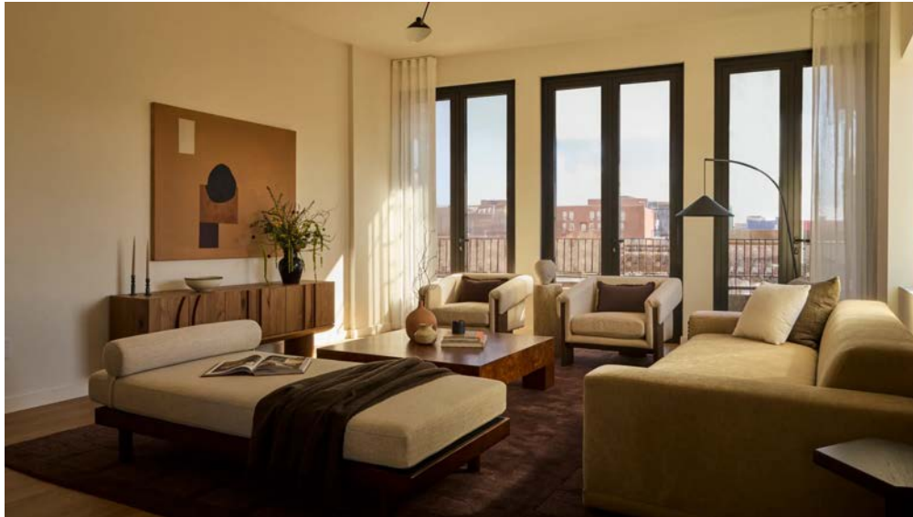
A living room that plays on shapes and textures: a Serge Mouille-style pendant lamp, a linen daybed by Sundays Furniture, a geometric oak console table, and a sand-colored velvet sofa create a harmonious ensemble that becomes the heart of a young family. Jonathon Hokklo

Workstead Studio designs a penthouse in Brooklyn that “dialogues with the architecture and light of Mexican architect Frida Escobedo.”