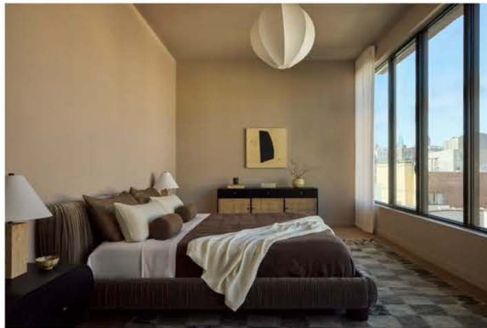
The master bedroom, illuminated by outside light, features travertine lamps and a camel velvet bench, creating a tranquil atmosphere. Jonathon Hokklo

The Bergen building is not just a residential building, but a true urban microcosm. Communal spaces dedicated to wellness, socializing, and culture intertwine with shared gardens and terraces, creating a continuum between interior and exterior. A cylindrical staircase bathed in natural light connects the different levels, becoming a sort of architectural totem that punctuates daily life. In this context, explains Ryan Mahoney, "the richness of the shared spaces made it necessary to think of the penthouse as a true sanctuary. We focused on intimacy and calm, with bespoke details and a balanced palette. The private spaces are designed to regenerate, balancing the vitality of the shared spaces."