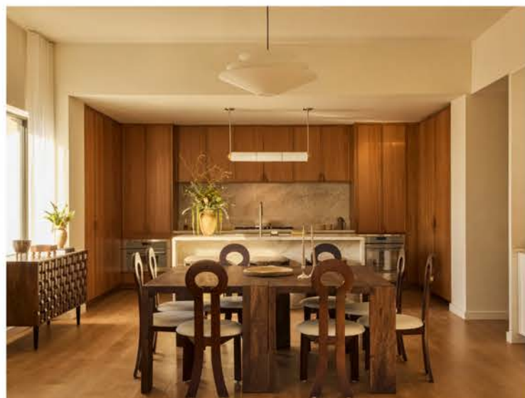
In the dining room, dark walnut combines with sculptural seating, linen suspension, accessories by Olive Atelier and a woven wooden console, in dialogue with the existing refined carpentry. Jonathon Hokklo