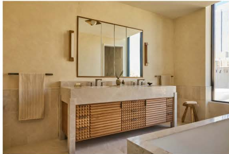
In the master bathroom, the Workstead-designed sink is complemented by small accessories, bath linens, and a sculptural stool by Treehuase, creating an elegant and luminous ensemble. Jonathon Hokklo

The heart of the penthouse is the kitchen, organized around white oak cabinetry , with handles carved directly from the wood, and complemented by a honed Taj Mahal quartzite countertop and cladding. Above the island, a pendant light designed by Workstead stands out, while to the side sits a custom-made wet bar, finished in light lacquer with bronze accents and a Kalahari stone countertop. This ensemble combines functionality and warmth, conceived as a natural extension of the living area. "Kitchens and bathrooms are the most tactile spaces in the home, and functionality always comes first, but it's softened by wood, artisanal details, and a warm yet restrained palette. Timelessness comes from proportion and rhythm," Mahoney continues.