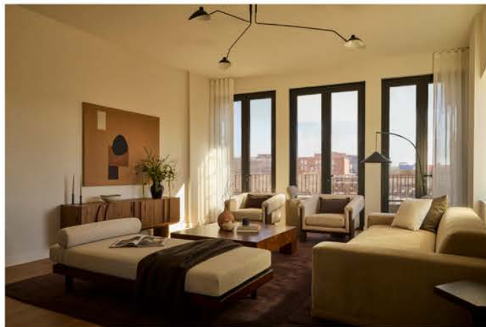
A living room that plays on shapes and textures: a Serge Mouille-style pendant lamp, a linen daybed by Sundays Furniture, a geometric oak console table, and a sand-colored velvet sofa create a harmonious ensemble that becomes the heart of a young family. Jonathon Hokklo

The Bergen penthouse reflects a new urban living style: Frida Escobedo's rhythmic and material architecture intertwines with Workstead's artisanal precision. The result is a home that transcends luxury to offer silence, light, and intimacy in constant dialogue with the city.