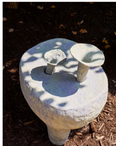
From left