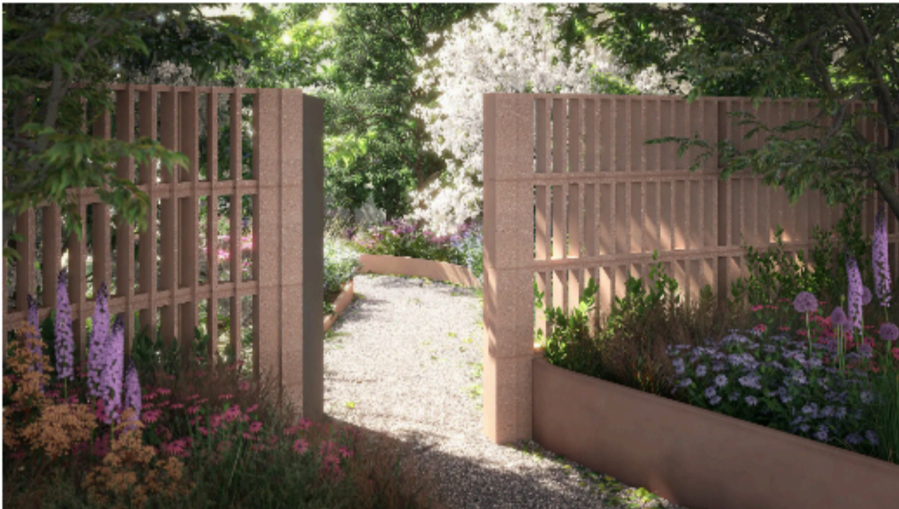
Dean Park entrance.

Two residential wings are connected at the center by the "Glass House," which acts as an entry point from both Dean and Bergen Streets.