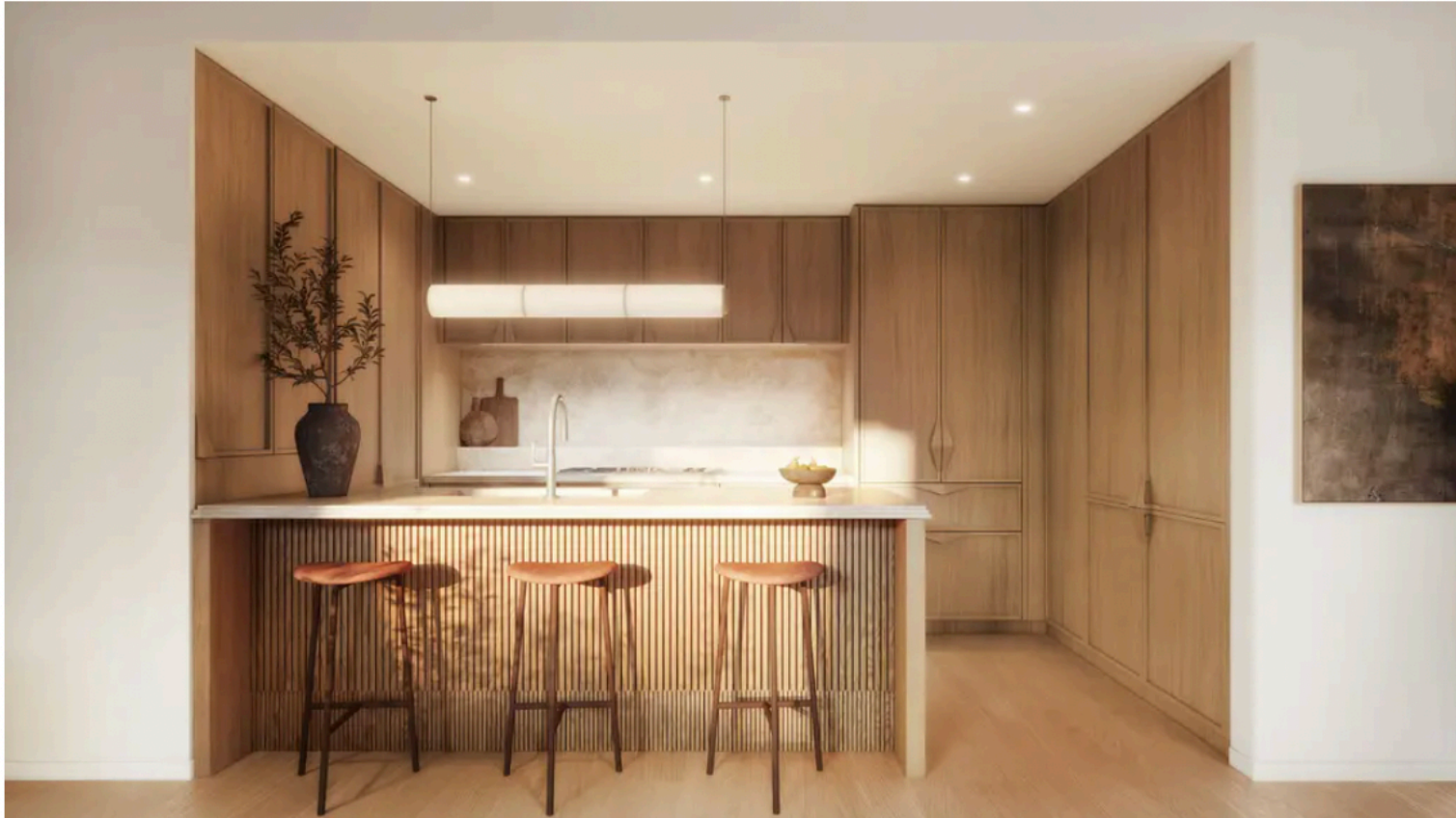
Bergen, #PH707E (AVDOO & PARTNERS DEVELOPMENT MARKETING INC)

Boerum Hill | Condominium | 4 Bedrooms, 3 Baths | 2,872 ft 2