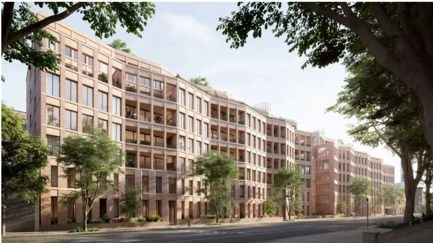
Bergen (Avdoo & Partners Development Marketing Inc.)