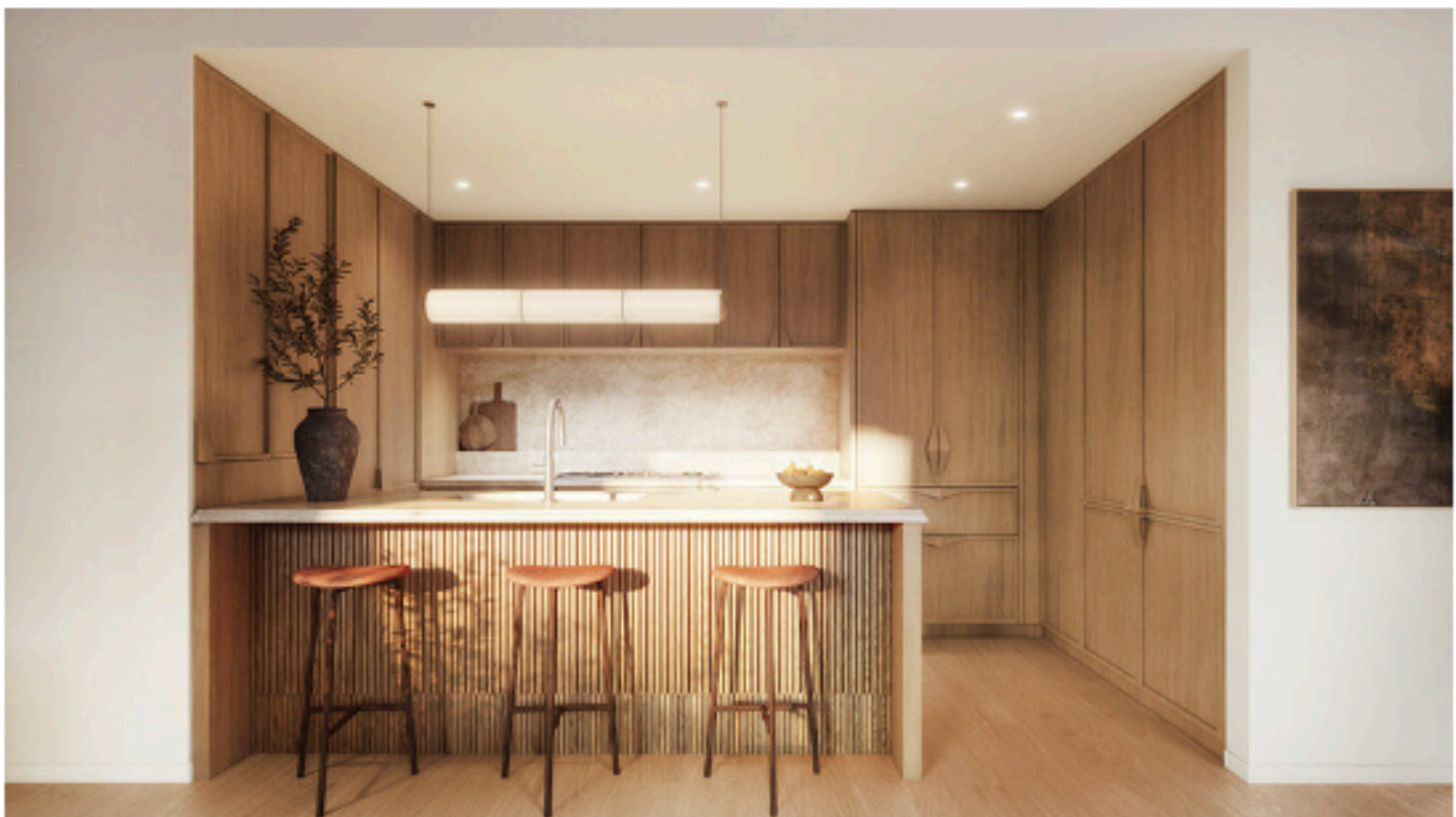
the architectural concept is a collaborative effort between Taller Frida Escobedo and DXA Studio