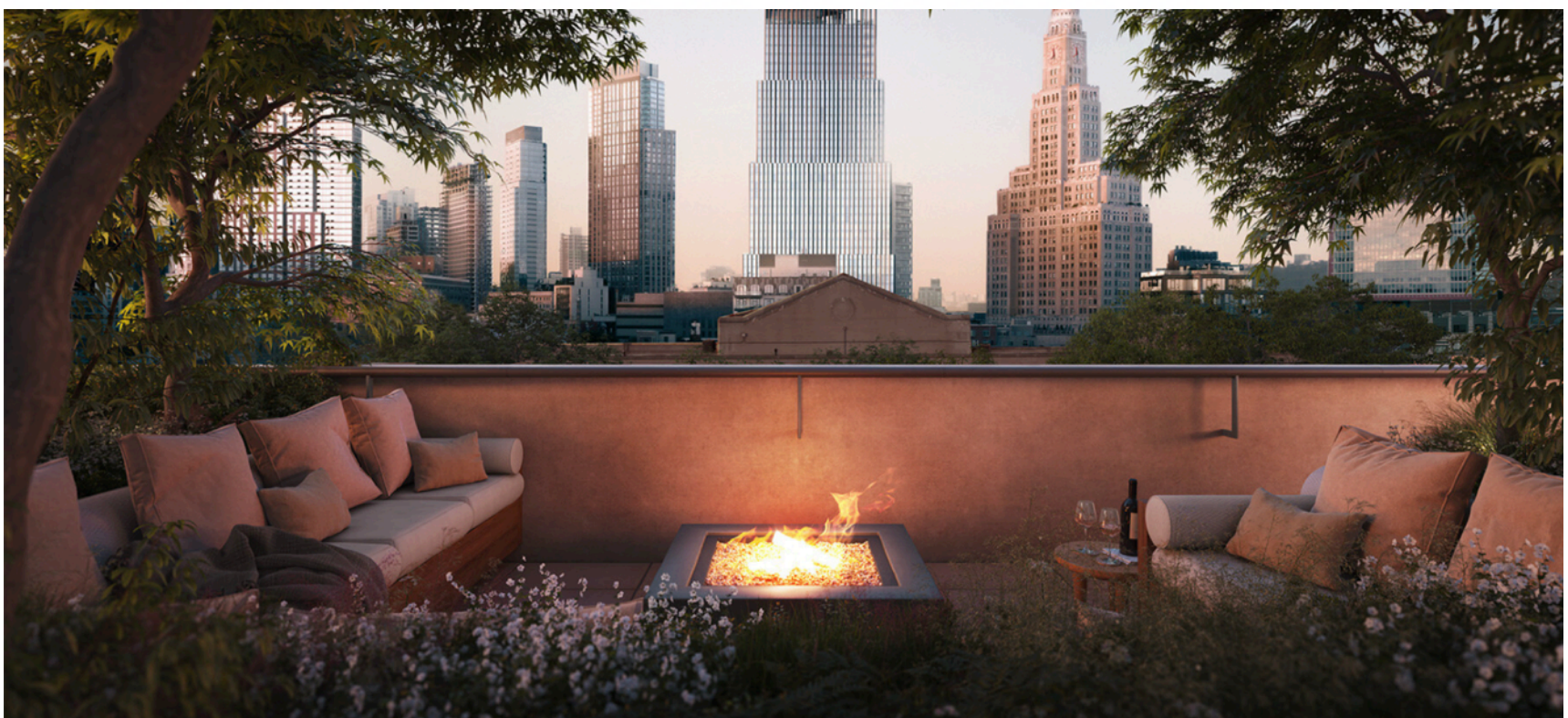
the seven-story condominium project, is under construction in Boerum Hill