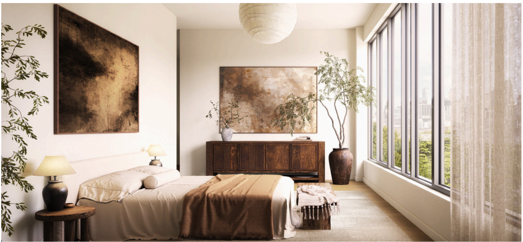
the building will introduce 105 luxury units, ranging from studios to five-bedroom residences