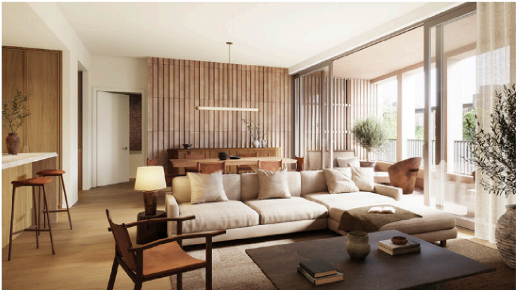
custom-made blocks shape the facade to create a unique interplay of light and air

Bergen offers residents over 14,500 square feet of amenities across four levels. Accessed by a cylindrical stairwell, these amenities — which include a cold plunge, a podcast studio, and a steam room — cater to a range of interests encompassing health, wellness and entertainment. In addition to the exceptional indoor offerings, residents can relax and socialize in over 12,000 square feet of garden outdoor spaces, including Dean Park and two communal rooftop terraces designed by the landscape team. Parking, storage, and bike storage are also available for purchase.