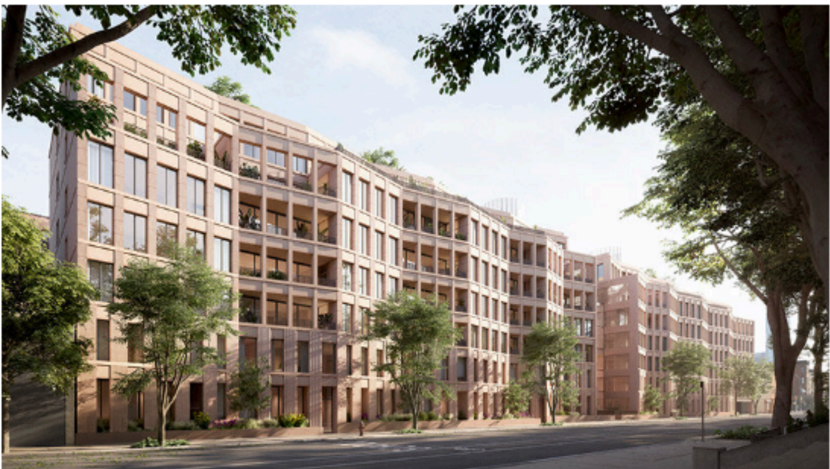
the seven-story condominium project is under construction in Boerum Hill

Avdoo & Partners Development aims to help Bergen strike that balance between unique and contextually sensitive. Thus, it is designed with a low-stance and rhythmically-pleated facade to create proportions that echo the surrounding townhouses. From its renders, the seven-story structure will be washed in a muted, pinkish hue. This marks Frida Escobedo's first foray into condominium design, and will be constructed concurrent with her ongoing redesign of the Metropolitan Museum of Art's new wing across the river (see designboom's coverage here ).