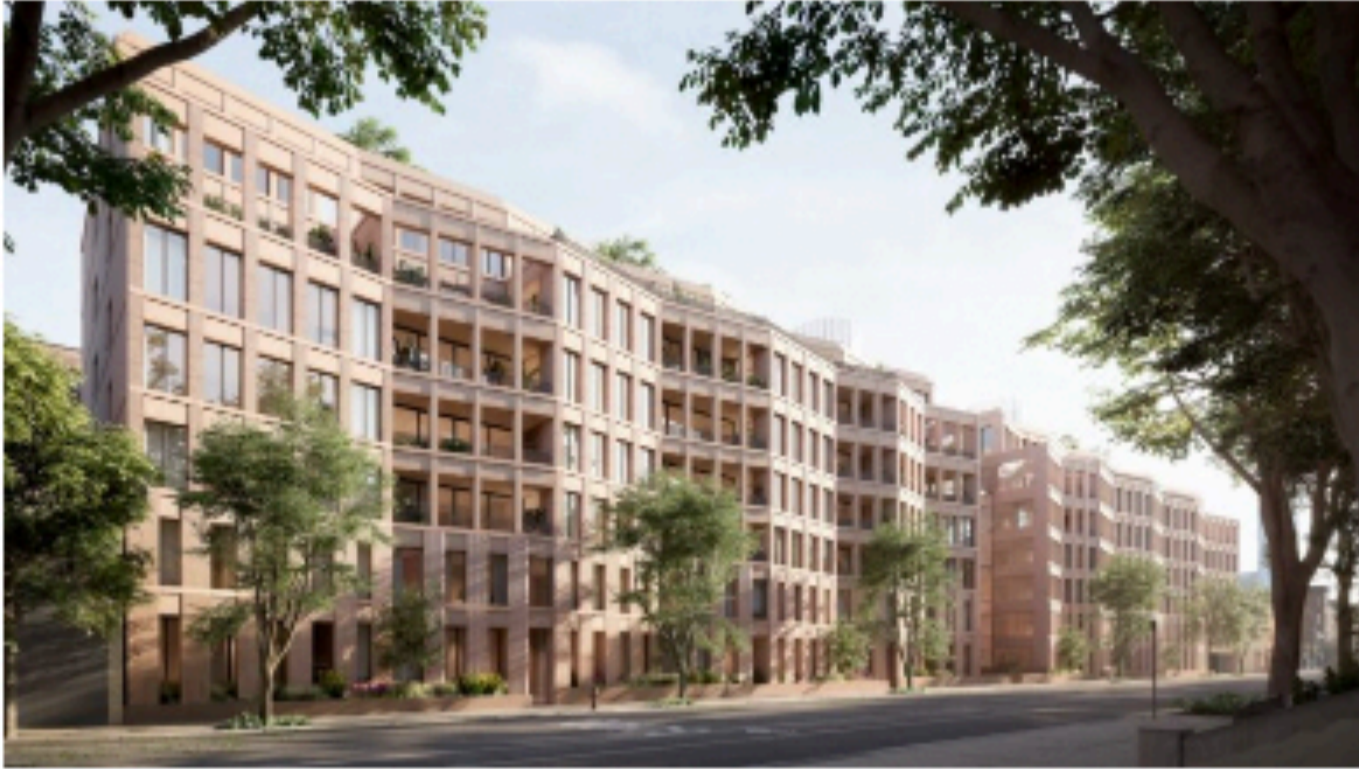
Rendering of Bergen

BY: MAX GILLESPIE 7:30 AM ON MARCH 22, 2024