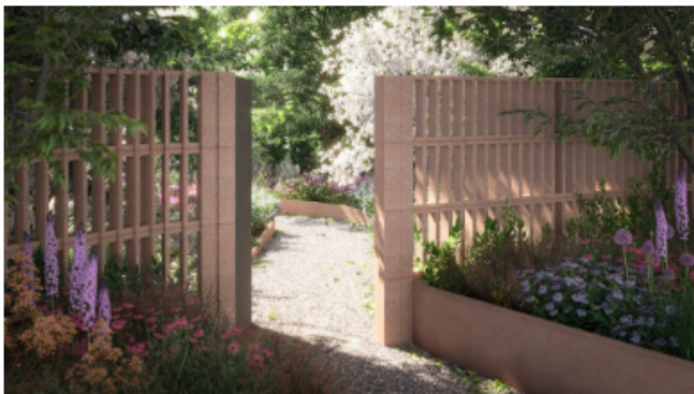
Rendering of exterior space at Bergen, courtesy of DARCSTUDIO

Bergen is located in close proximity to the Atlantic Avenue-Barclays Center station, which is served by the 2, 3, 4, 5, B, D, N, Q, and R trains.