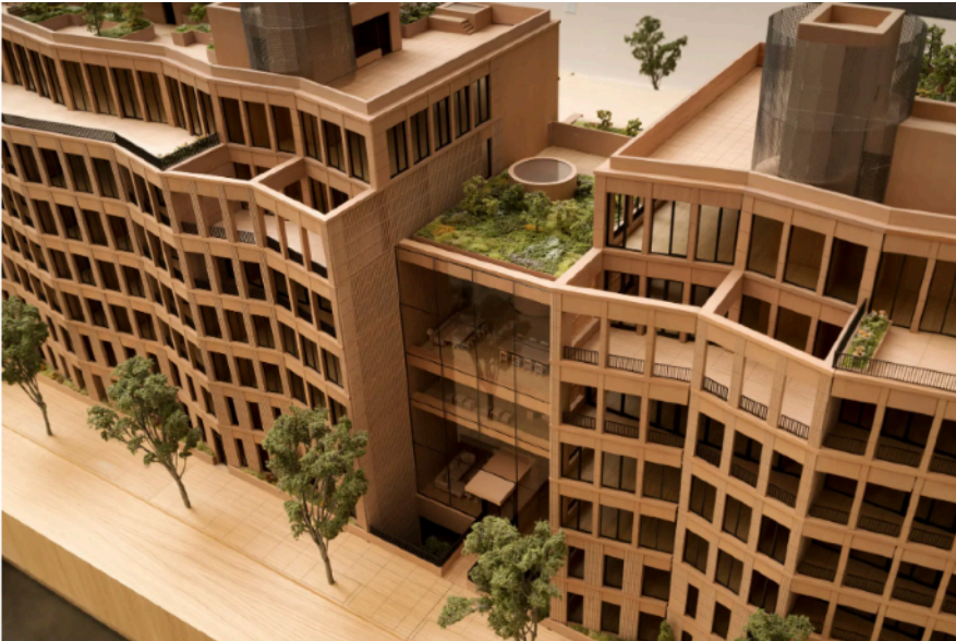
An architectural model of Bergen, which will have 105 units ranging from studios to five-bedrooms.

The architect of Bergen, in Boerum Hill, is Frida Escobedo, who recently landed the commission to redesign a wing of the Metropolitan Museum of Art.