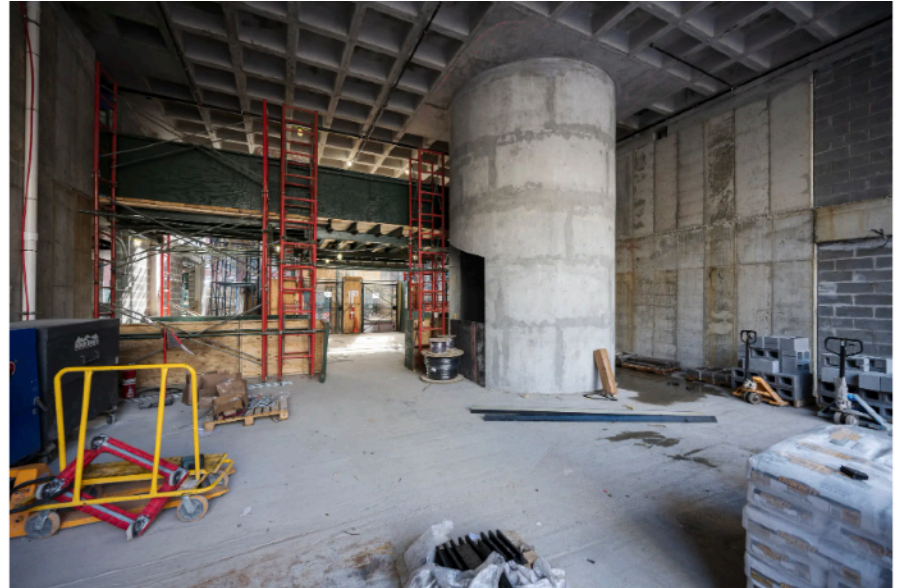
The building is scheduled to be completed in late 2024 or early 2025.

The seven-story Bergen is a bit taller than most of its neighbors and occupies much of the block of Bergen Street between Third and Fourth Avenues. In renderings, the exterior, made of precast concrete brick, appears fairly muted — except for its gently pleated, zigzag pattern. The building doesn't look too ostentatious on a block of brick townhouses, brownstones and some newer apartment complexes.