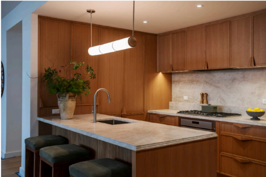
A nearby sales gallery gives potential buyers a glimpse of the building.

DXA Studio did the master planning for the project, and Workstead did the interior design. The developer, Avdoo & Partners, isn't new to the neighborhood; the real estate firm also opened the nearby 58 St. Marks Place , which stands out in a way Bergen doesn't.